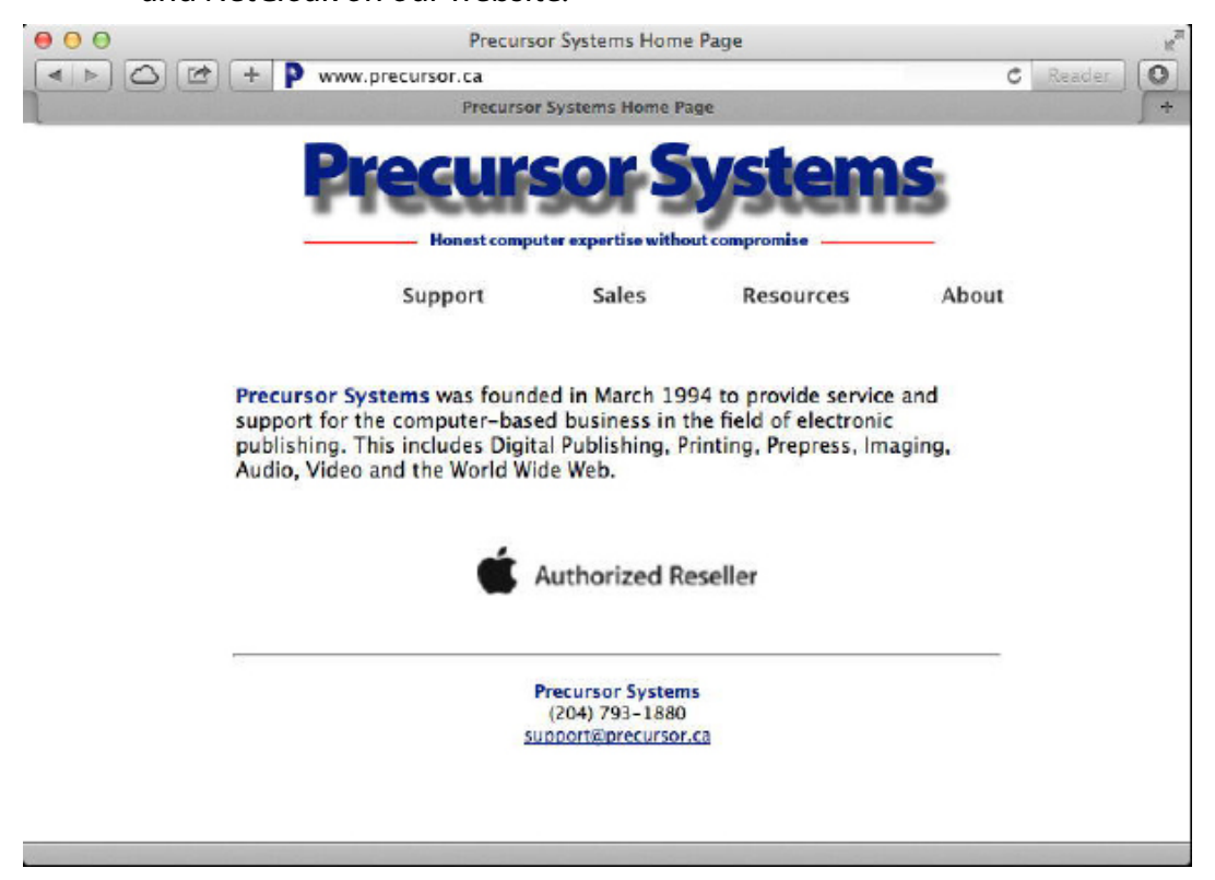
Precursor web site circa 2004

"precursor.mb.ca" and in when the Canadian domain name registry allowed we moved on to "precurosr.ca". The web site really hits its stride in 2004 when we stopped sending out PDFNews and began our modern, complex html newsletter that had extensive integration with FileMaker and NetCloak on our website.